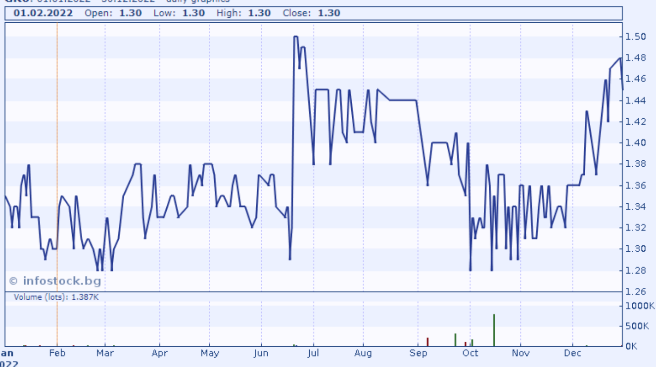
GR6: 01.01.2022 - 30.12.2022 - daily graphics